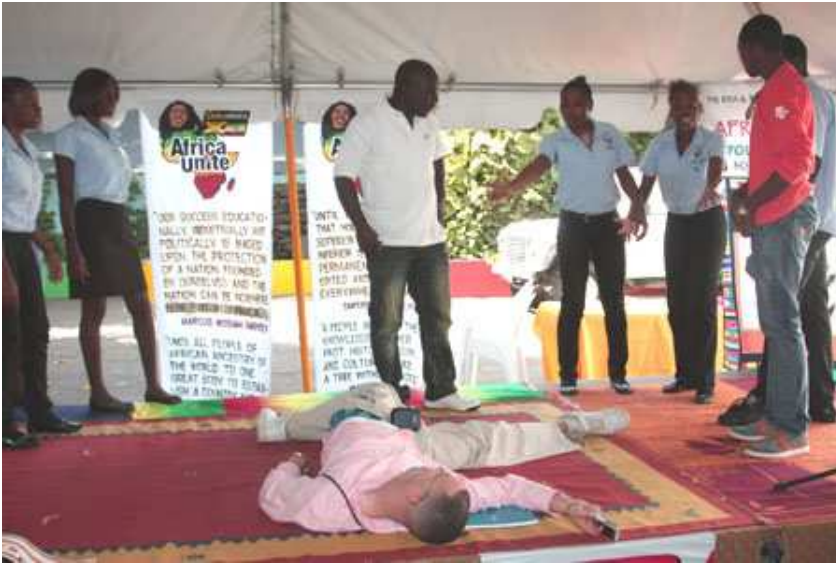
Skits depicting effect of crime on youth

As a result of this symposium I have a greater appreciation for my history as a young woman of African descent. It has sparked a curiosity to learn more about where I came from so that I can better understand my present way of life. Being the founder of a UNESCO youth group “Pioneers for Peace”, I intend to use this as a medium to raise the awareness of Africa Unite as it pertains to my country Trinidad and Tobago.