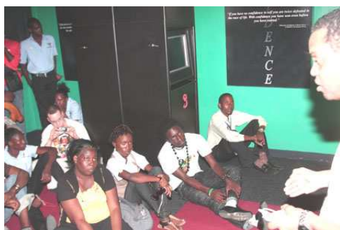
Visit to Marcus Garvey Museum

You teacher used teach about Christopher Columbus / And you said he was a very great man / You used to teach about Marco Polo / And you said he was a very great man, so