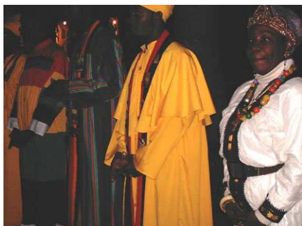
Mrs. Rita Marley and priests from the Ethiopian Christian Orthodox Church at the Christmas celebration

While in Nassau Mrs. Rita Marley made a donation of US$1000 to the victims of the earthquake that recently devastated Haiti.