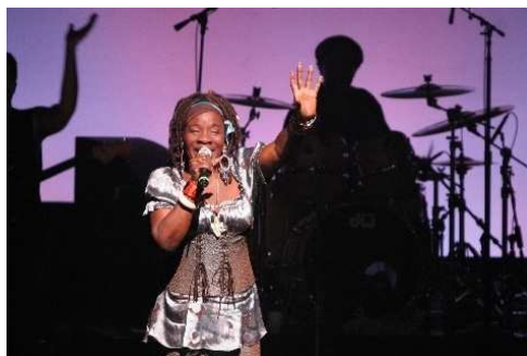
Mrs. Rita Marley in concert