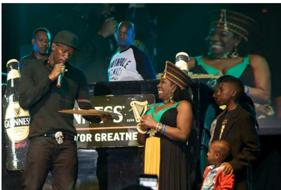
Hon. Bolt, Mrs. Rita Marley & family

You teacher used teach about Christopher Columbus / And you said he was a very great man / You teacher used teach about Marco Polo, so — Peter Tosh