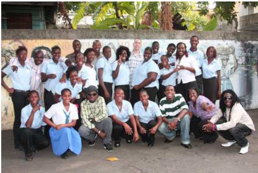
Youth Symposium participants

G reetings to all, I must say that I am truly honoured to have been a part of this symposium. The knowledge and experience gained was far beyond my expectations. I was exposed to a wealth of information on the concept of Africa Unite, the effects of popular music on youth and how crime affects us as young people. The motivational speakers and the group discussions were well planned and executed.