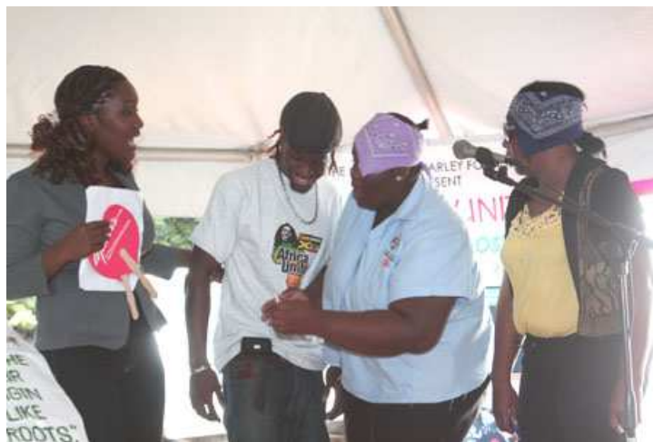
Skits depicting effect of crime on youth

The discussions among the youth and the speakers were enlightening and gave information to which myself and others can relate to and understand. We came to conclusions on the causes of crime and solutions to solve this problem. Memorable moments were created at the few tours given. We got a chance to explore the house of Robert Nesta Marley which is now a museum dedicated in his honor and also the Marcus Garvey Museum.