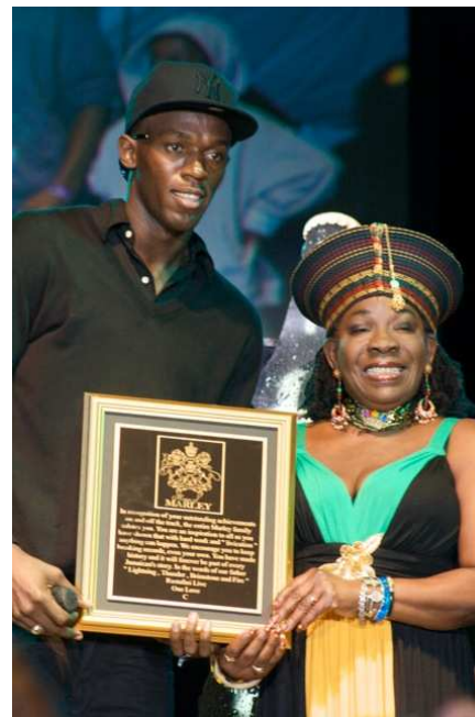
Mrs. Rita Marley presents on behalf of the Marley family