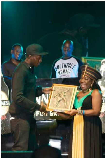
Hon. Usain Bolt presents gift to Mrs. Rita Marley OD